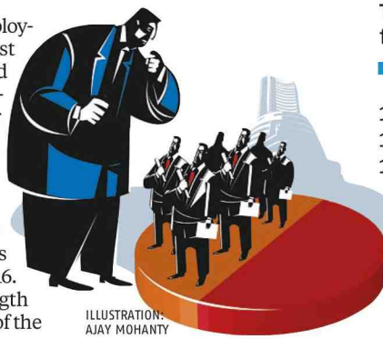
ILLUSTRATION: AJAY MOHANTY